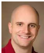
John M. Streicher Department of Pharmacology, College of Medicine, University of Arizona, Tucson AZ USA